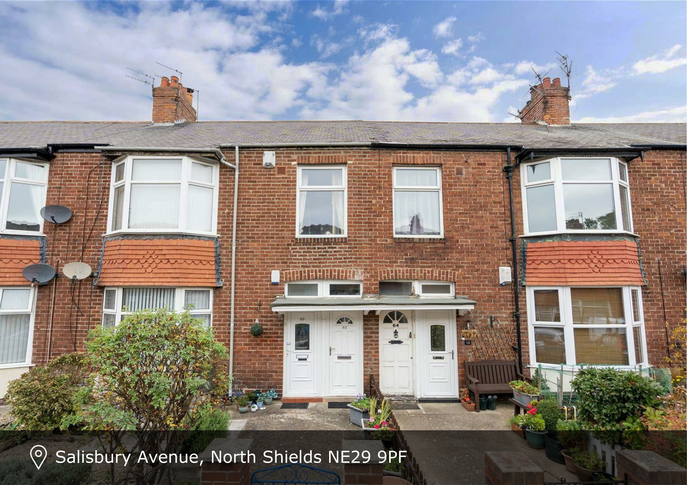
📍 Salisbury Avenue, North Shields NE29 9PF